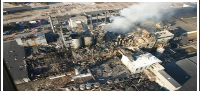
Imperial Sugar Plant, 2008